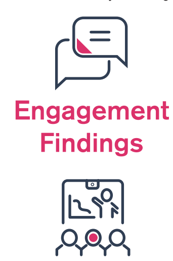
Figure ES-1: Pathway to Strategic Direction